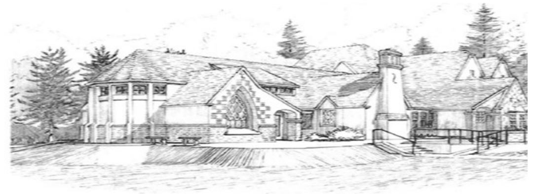
Clarksburg Community Church

Please look soon for sign ups in the church entrance.